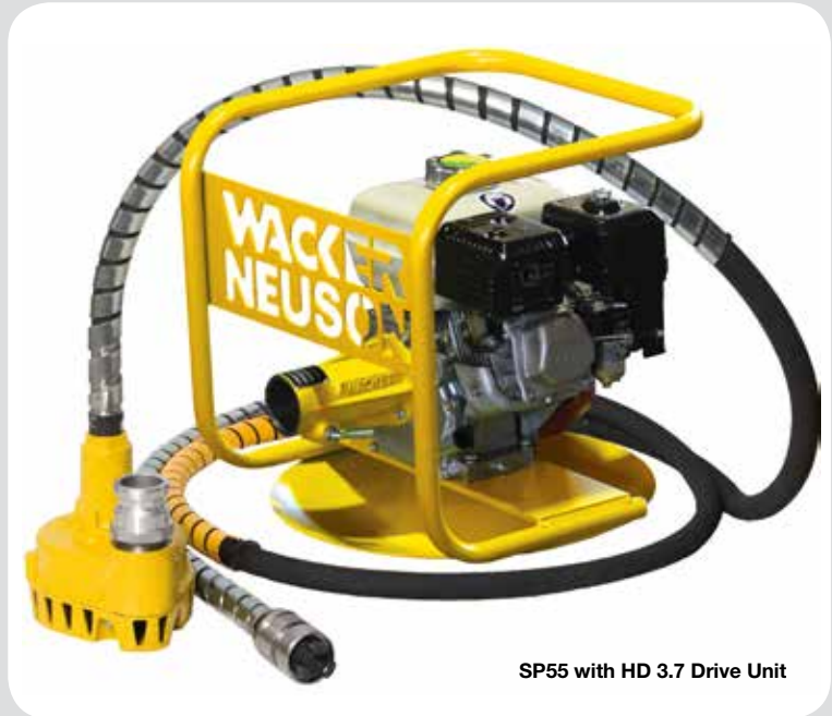
SP55 with HD 3.7 Drive Unit